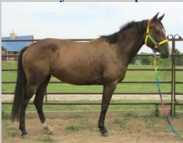
Miss Pairadise, a.k.a. Cheyenne Rescued mare, Date of birth: May